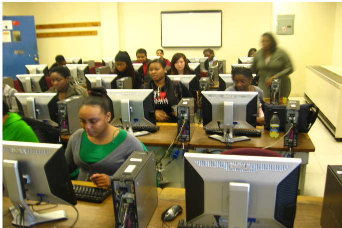
Figure: PreCalculus Spring 2010