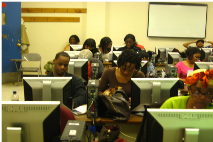
Figure: Calculus I Spring 2010