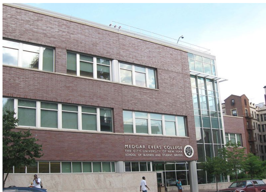
Figure: Crown Heights, Brooklyn NY